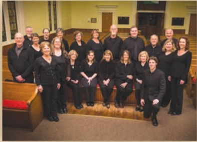
NORTHERN ADIRONDACK VOCAL ENSEMBLE